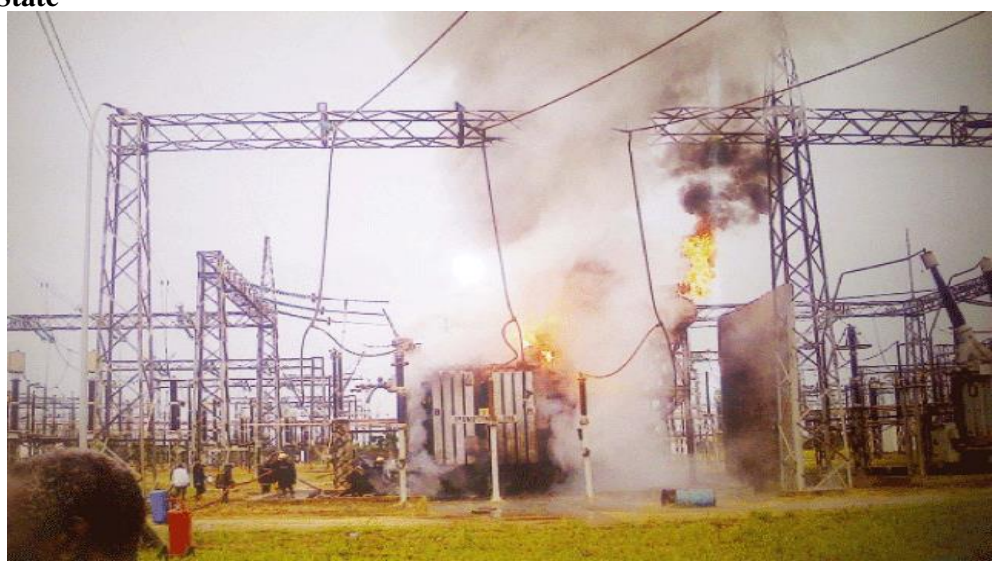
Figure 2: A typical overloaded electric power sub-transmission line, Alaoji, Abia State